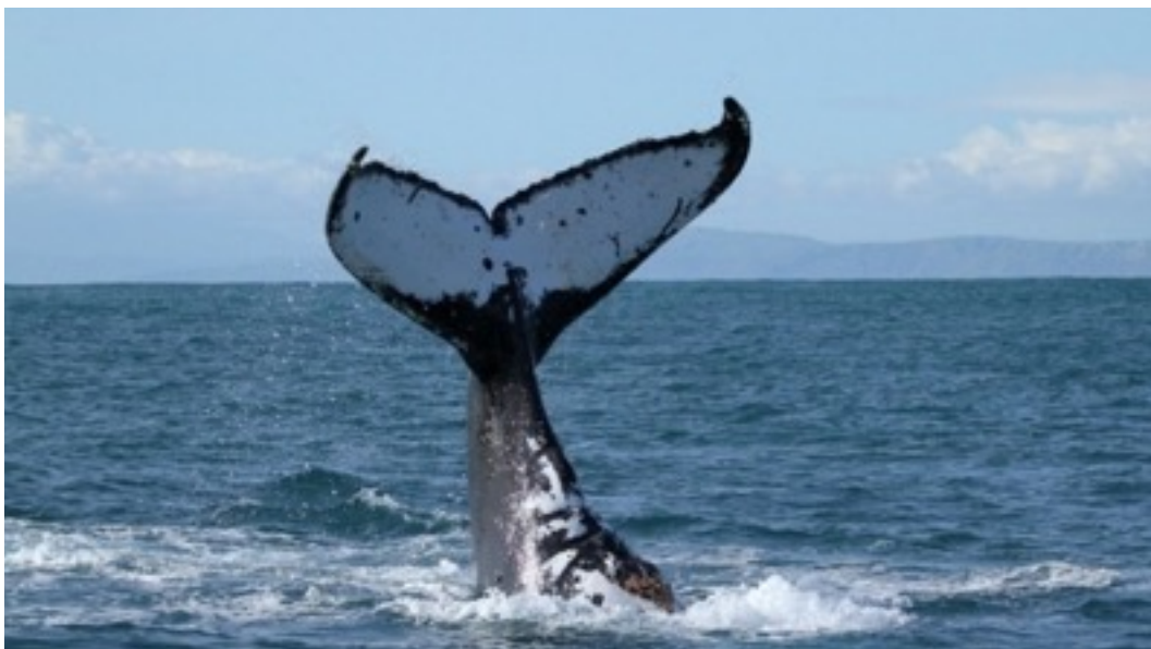
DOC - NZ's local wildlife can make you feel like you are on a David Attenborough show.

Whether it's seals, penguins, dolphins or whales, New Zealand's local wildlife always made me feel like I was on a David Attenborough show than a five-minute walk from my apartment.